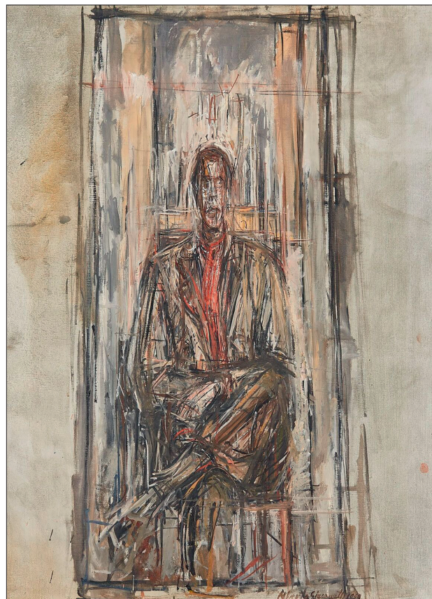
Diego Seated, 1948. Oil paint on canvas, 80.5 × 65 cm. Sainsbury Centre for the Visual Arts, Norwich. © Alberto Giacometti Estate, ACS/DACS, 2017.

It is the distance between the figures, the aggressiveness of the void and the lingering hate in the silence that is so haunting. In this existential community there is no conversation, no celebration of trust, no encouraging and enabling relationship, no collaboration and fighting for shared values,