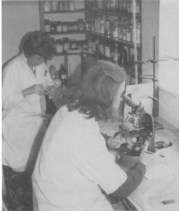
Figure 3. The laboratory

We have observed that one of the bacteriological advantages of the laboratory is the avoidance of the deterioration of specimens in transit, which as MacNaughton, et al. (1965) point out, may involve swabs drying, contaminants multiplying, and pathogenic organisms perishing. The figures for the three months following the period under review show a further increase of about 29 per cent in the specimens cultured.