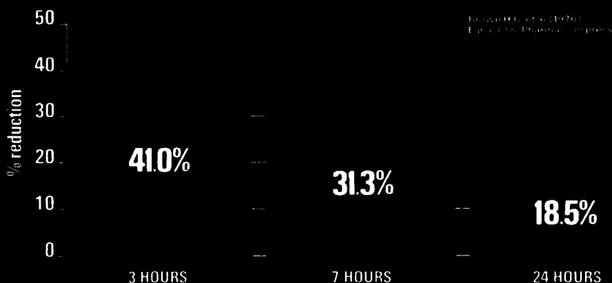
Beta-Cardone: % reduction in exercise tachycardia after 400mg dose orally

The exceptionally long action of Beta-Cardone in exercise tachycardia is clearly illustrated in this chart. As long as 24 hours after a 400 mg dose, there is still an 18.5% reduction in exercise heart rate.