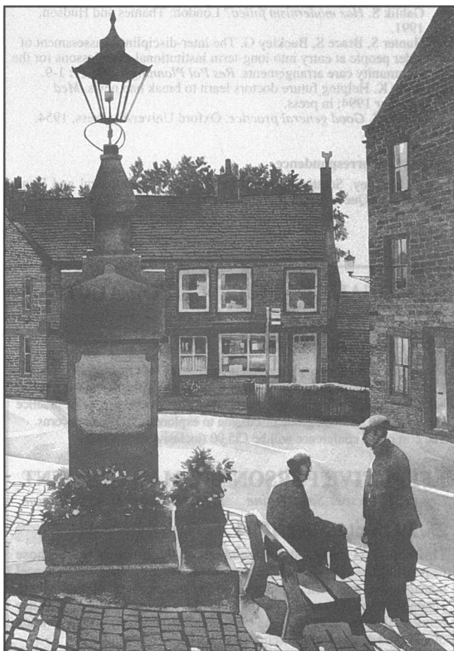
Figure 2. Drinking fountain in Dobcross, erected in memory of Dr Ramsden.

Culturally, I believe that the tide is in favour of general practice. I illustrate this by reference to my own experience. I grew up in a Yorkshire Pennine village 40 miles south of Aysgarth and passed each day on my way to school a drinking fountain in the village square (Figure 2). Erected by public subscription in memory of Dr Ramsden, the local country doctor who practised at the beginning of this century, the fountain is a symbol of the position general practitioners occupy close to the heart of the community. Coming from this background, I was surprised at medical school in Edinburgh amid the elegance, traditions and splendours of the