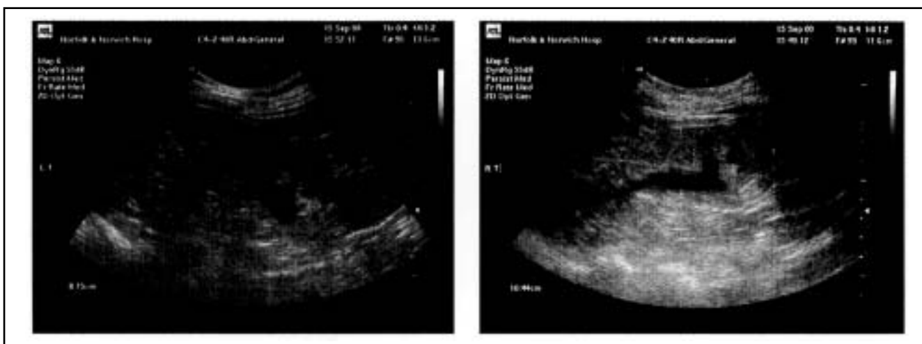
Figure 2. Follow up ultrasound scan showing complete resolution of hydronephrosis after pessary insertion.

at least one-third of adult women. However, only a minority volunteer their symptoms, 11 as is the case with various other clinical conditions, and this trend increases with increasing age. As a result, only those undergoing surgery for their prolapse have the benefit of preoperative renal imaging to rule out hydronephrosis, with or without renal impairment. Hence, the true incidence of hydronephrosis related to prolapse will remain underestimated and its prevalence in the asymptomatic patients in the community unclear, until they present with unrelated vague symptoms at a later stage.