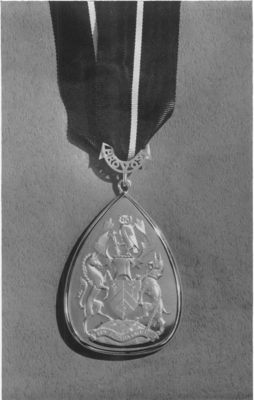
Photograph of pendant designed by Messrs Gerrard for provosts of faculties