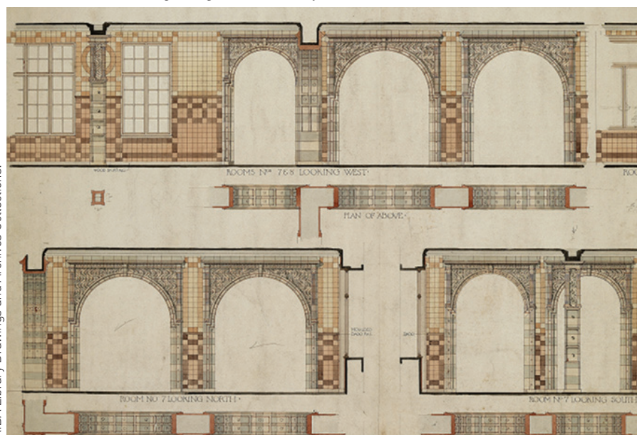
1906–1908 contract drawings: the glazed brown and yellow tiles.

RIBA Library Drawings and Archives Collections.