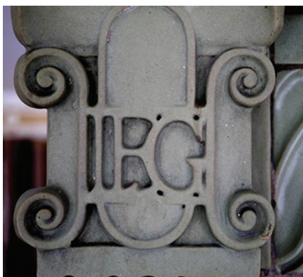
London Edinburgh and Glasgow Assurance Company motif.

the headquarters of the NAAS until the National Insurance Act of 1946 abolished approved societies.