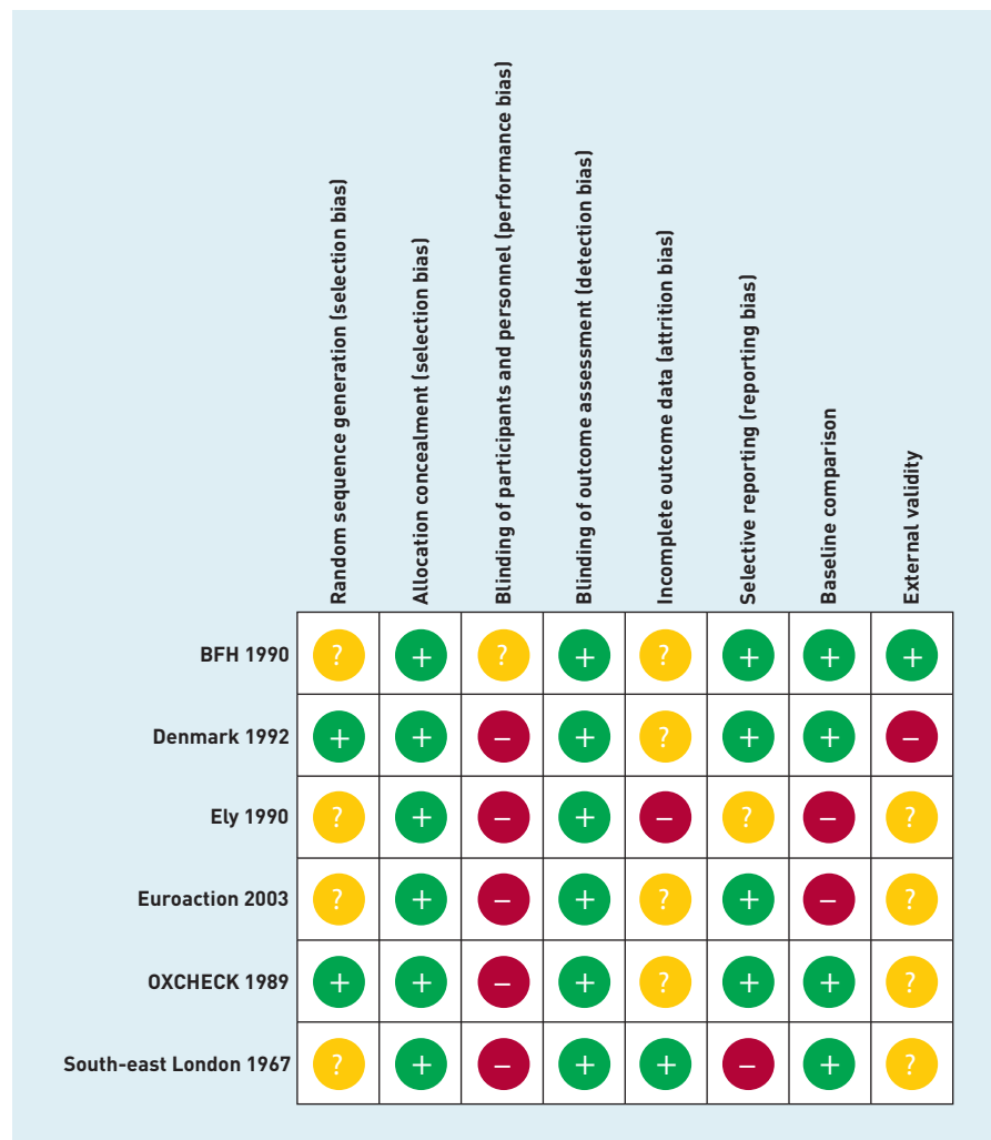
Figure 2. Summary of bias in included studies.

study, but a multiple risk factor screening strategy was adopted. 17