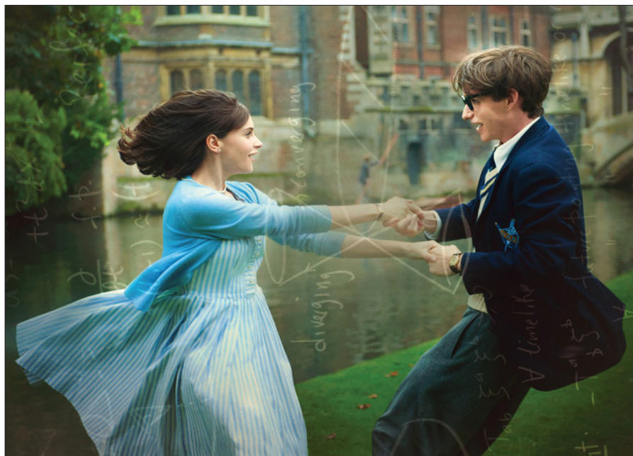
The Theory of Everything | The Power of Love. Stephen Hawking (Eddie Redmayne) and Jane Wilde (Felicity Jones). The film is based on the memoir Travelling to Infinity: My Life with Stephen , by Jane Hawking.

The fact that Hawking is still alive 50 years later, operating his voice command with the one remaining working muscle in his right cheek seems an almost messianic victory over time and fate. For an astrophysicist