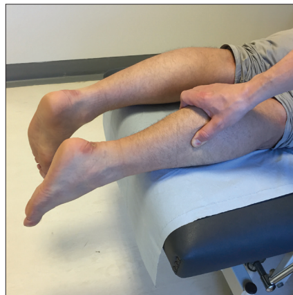
Figure 3 and 4. Pre- and post-calf squeeze.