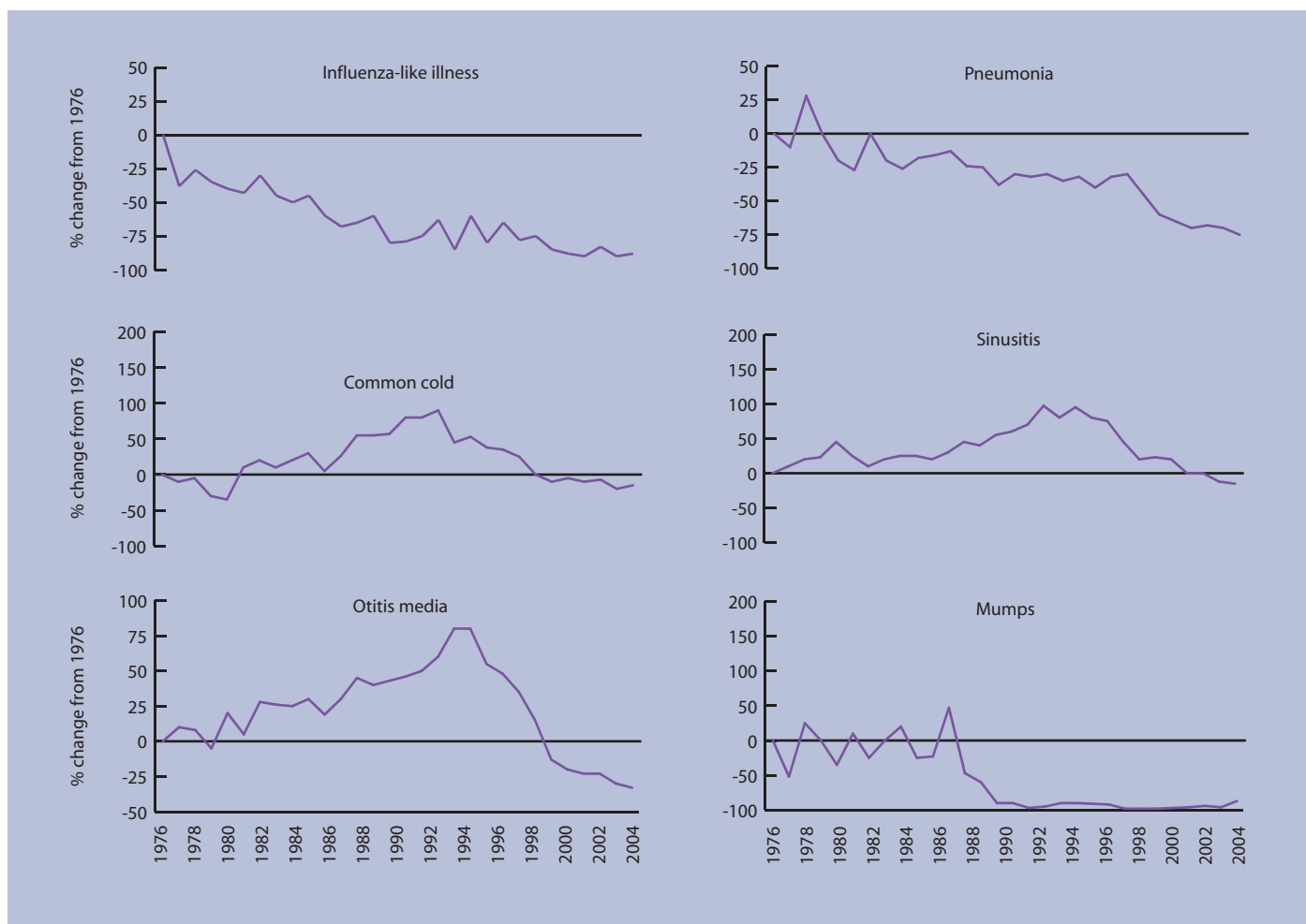
Figure 1. Percentage change since 1976 in the annual new episode incidence of selected diseases reported by the RCGP Weekly Returns Service